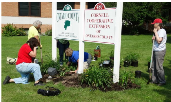
Master Gardeners beautifying the plantings at the Cornell Cooperative Extension office in Canandaigua.

The Master Gardener volunteers are a critical component in extending knowledge about consumer horticulture within our county. There are currently 39 active Master Gardener volunteers in Ontario County. They volunteered 1875 hours, offered 24 programs that reached 1674 youth/adults and had direct contact with an estimated additional 1560 Ontario County residents. Each May, our volunteers host a popular Plant Sale to generate scholarship funds for eligible student awards at Finger Lakes Community College and 4-H Camp Bristol Hills. The action-oriented Inside Dirt newsletter is distributed to more than 139 subscribers and complimentary copies are provided to county supervisors, CCE Board of Directors, libraries and town halls throughout Ontario County. Inside Dirt, is packed each month with articles about homes and grounds.