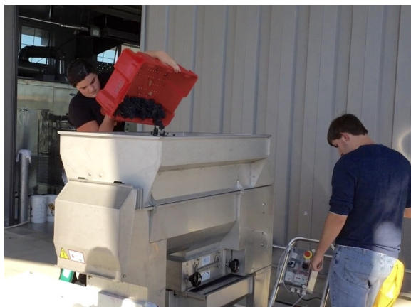
Students from the FLCC Viticulture & Wine Technology program crushing the first grapes to be processed at FLCC's brand new Viticulture & Wine Technology Center in Geneva. The fruit comes from the Teaching & Demonstration Vineyard, managed by the FLGP and FLCC.

In 2012, the Finger Lakes Grape Program entered into a partnership with Finger Lakes Community College's Viticulture & Wine Technology Program to develop and operate a 2.5-acre Teaching & Demonstration Vineyard (TDV). The TDV contains 15 different varieties of grapes, and acts as a teaching and research resource for both programs. FLCC students get hands-on experience with important vineyard practices like pruning, training, shoot and leaf thinning, crop control, pre-harvest sampling and more. The TDV is the source of all of the grapes used by FLCC students in their