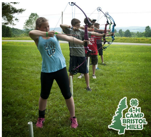
Campers from 5-15 years of age enjoy a wide variety of traditional summer camp activities at 4-H Camp Bristol Hills.